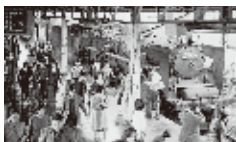
View showing how busy the station would get

This is the oldest standing wooden station building in Hokkaido. It served large numbers of travelers as the last stop on the Muroran Main Line from 1912 to 1997. Although there have been various renovations, the Western-style architecture that was adopted during the Meiji period (1868-1912) is clearly visible in the hipped roof, whitewashed plaster walls, and the overhang that wraps around the front and sides. The steam locomotive was placed in 2019 and the facilities including this station building (Tantetsu Port) was registered in May 2019 as a Japan Heritage site.