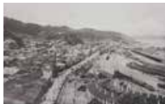
Engine Shed and Station Buildings, Prewar

The first Muroran Station was built in 1897, and the station was later relocated several times due to port expansions. This building, the fourth generation, was opened in 1997. Designed on the concepts of “wind-filled sails” and “whales and dolphins on the water”, it stands near the site of a former engine shed on the old station grounds.